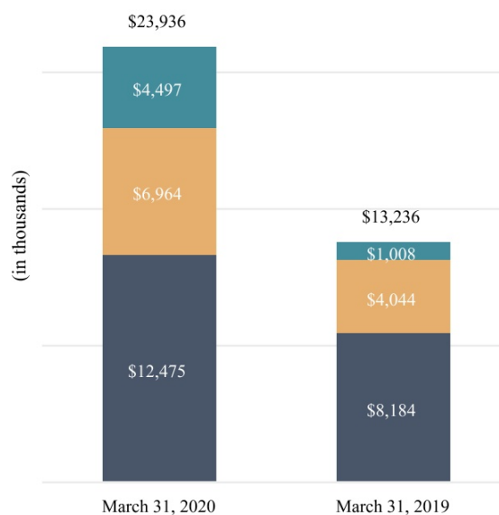
Selling, General, and Administrative Expenses For the Three Months Ended March 31, 2020 and 2019